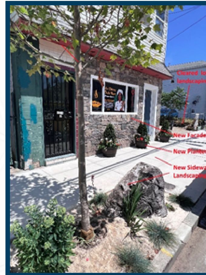
Beautification of Ducktown Arctic Ave