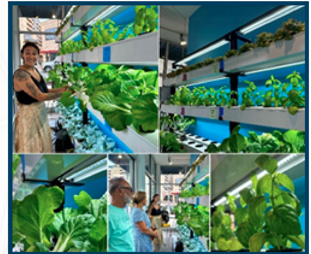
Micro-Grants to Ducktown's small businesses like CROPS for hydroponic farming